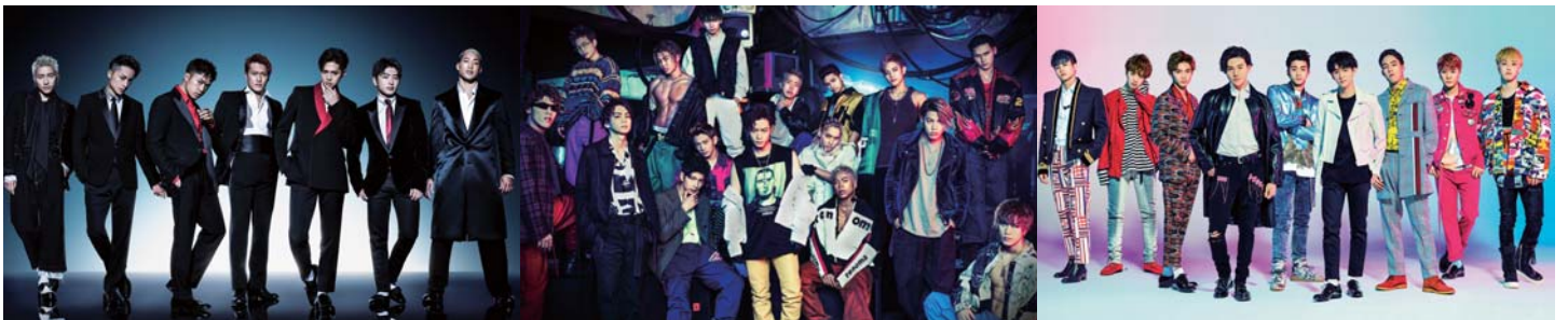
Jr. EXILE GENERATIONS / THE RAMPAGE / FANTASTICS