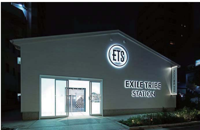
EXILE TRIBE STATION TOKYO

The official store for LDH artist merchandise available online and with locations in Tokyo, Osaka, and Taipei (Taiwan). Limited edition, EXILE TRIBE STATION exclusive items are sold here as well.