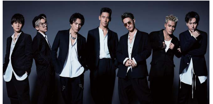
J Soul Brothers III