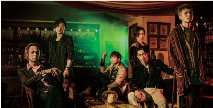
EXILE THE SECOND

2008~ ————— 2nd GENERATION 2010~ ————— 3rd GENERATION