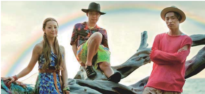
DANCE EARTH PARTY