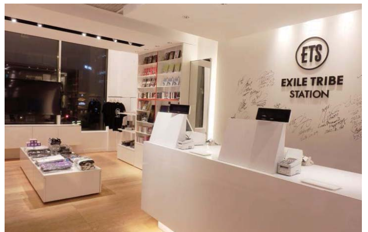
EXILE TRIBE STATION OSAKA